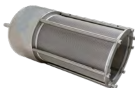
Washing Drum 2.5 kg