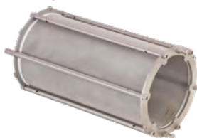
Washing Drum 3.5 kg