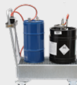
Supply and Dispo- sal carriage