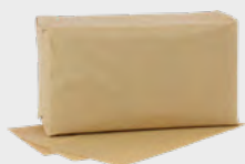
Insert Paper for Centrifuge Cup