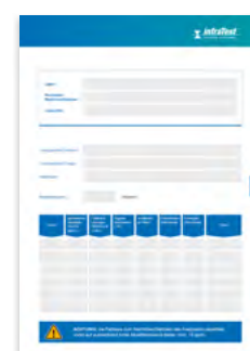
Solvent Log Book