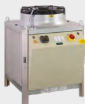
Water Cooling Unit