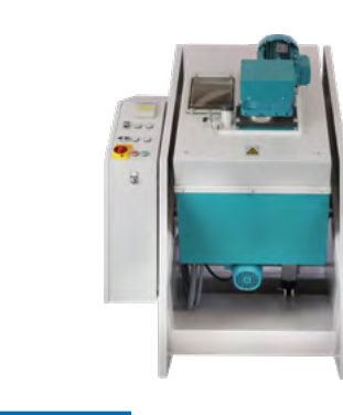
Parallel Griding and Cutting Machine 450 mm